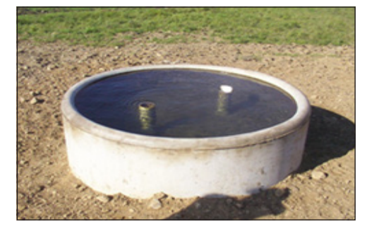
Permanent concrete water trough