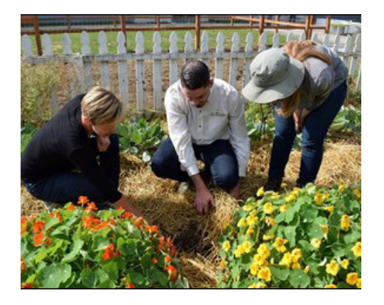
NRCS conservationist assisting small scale farmer with developing a customized conservation plan.

To file a program discrimination complaint, complete the USDA Program Discrimination Complaint Form, AD-3027, found online at How to File a Program Discrimination Complaint and at any USDA office or write a letter addressed to USDA and provide in the letter all of the information requested in the form. To request a copy of the complaint form, call (866) 632-9992. Submit your completed form or letter to USDA by: (1) mail: U.S. Department of Agriculture, Office of the Assistant Secretary for Civil Rights, 1400 Independence Avenue, SW, Washington, D.C. 20250-9410; (2) fax: (202) 690-7442; or (3) email: program.intake@usda.gov.