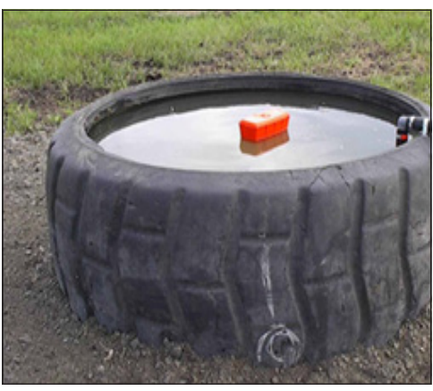
Heavy equipment tire waterer