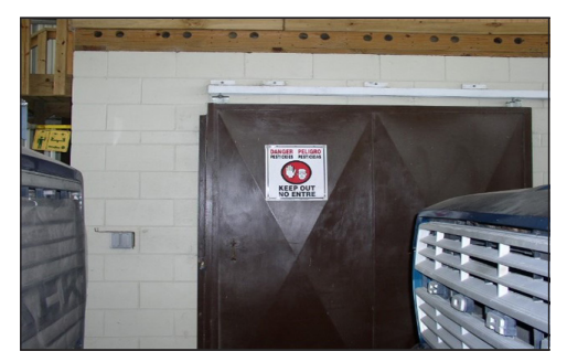
Keep livestock and children out of well. It's dangerous!

On some sites you may be able to use a synthetic liner instead of concrete. A roof can cover the mixing area to keep out rainwater. A small building may be needed for safely storing chemicals.