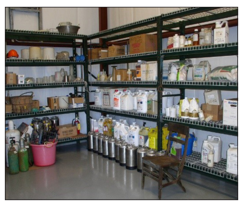
Proper chemical storage is critical to the safety in your operation.