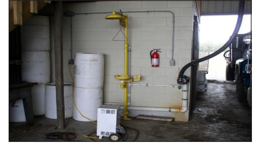
Components of an Agricultural Handling Facility.