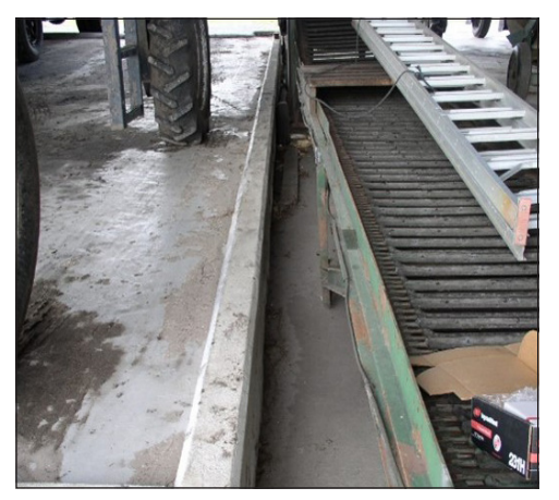
Containment of spillage part of the Ag.Chemical Facilities.