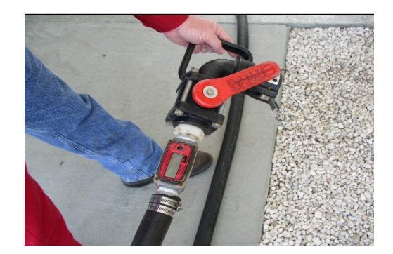
Calibrate equipment for correct application rates.