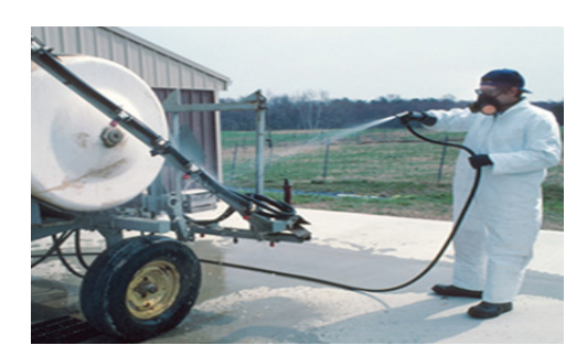
Collect wash water from cleaning spray equipment.