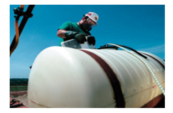
Calibrate equipment for correct application rates.