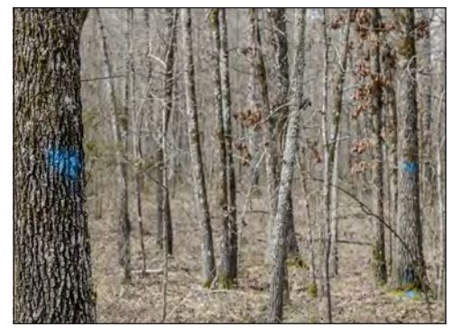
Trees marked for cutting with blue paint.