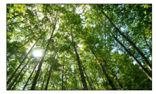
Management of sunlight is part of the techniques used by foresters to help you accomplish your goals.

The consulting forester/state forestry agency forester will make sure you get paid fair market value for your trees and protect your forest resources by managing post-harvest tree planting to enhance tree regeneration.