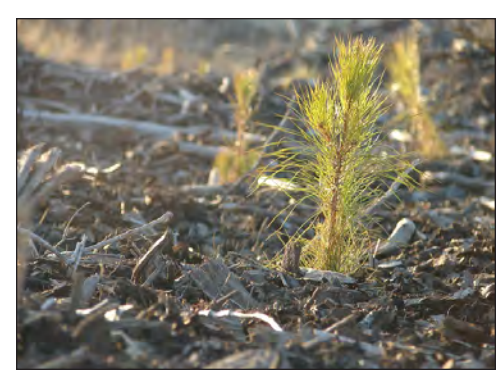
Management of your woodlots will depend on your species.