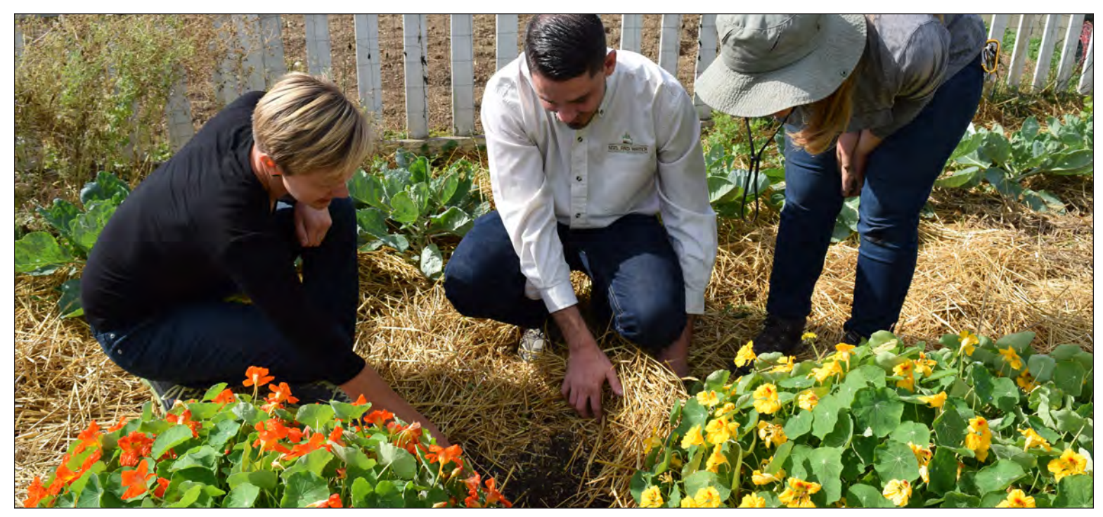
NRCS partner assisting small scale farmer with developing a customized conservation plan.

Visit the Natural Resources Conservation Service or visit farmers.gov/servicelocator to find your local NRCS office. You can also check with your local USDA Service Center, then make an appointment to determine next steps for your conservation goals.