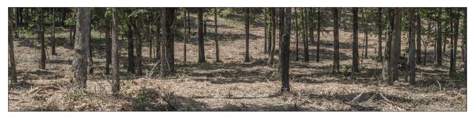
Foreststand after thinning. A mulcher was used to clear brush to ground level.