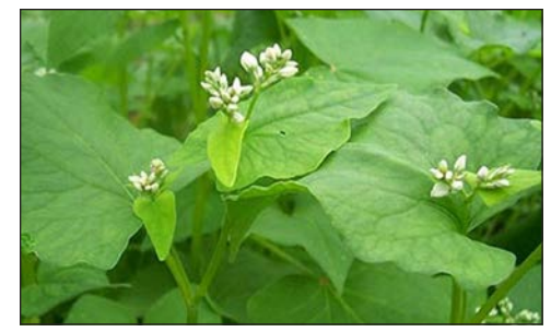
Buckwheat is a short season cover crop that suppresses weeds while improving soil quality.