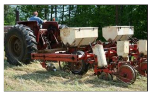
Cash crops can be seeded directly into rolled or killed cover crops or crop residue.