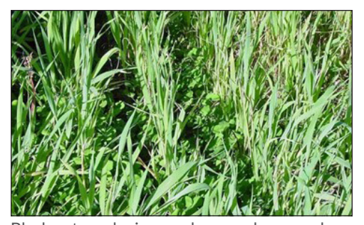
Black oats and crimson clover make a good cover crop mixture in some areas.