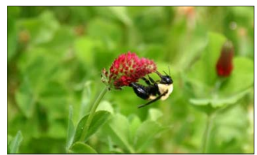
Crimson clover is an excellent legume cover crop for the South providing cover for the soil, nitrogen for the next crop, and pollen for bees.