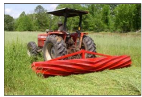
A specially designed roller crimps the rye stem and lays it flat. The next crop is no-tilled into the cover.