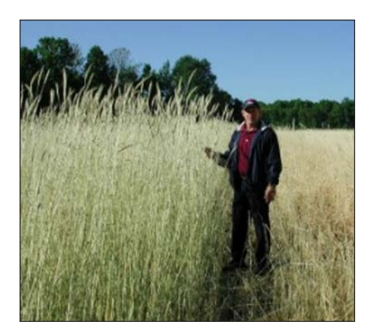
Rye cover crop.