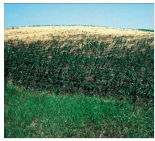
Corn growth showing effects from eroded soil. Cover crops provide residue to build soil organic matter and improve soil quality.