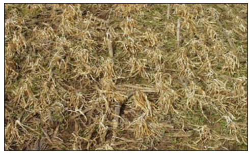
Fall seeded oats provide erosion control over the winter until spring crops are established.