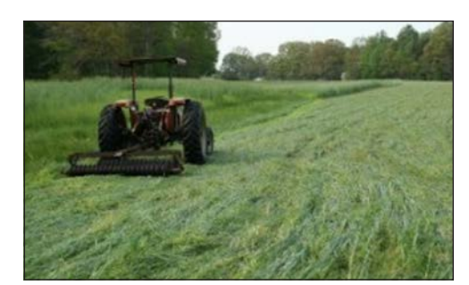
Recycled farm equipment can be used to roll down a rye cover crop. No disking or herbicides is needed.