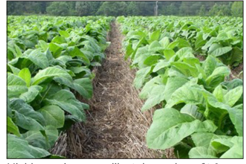
Highly erosive crops like tobacco benefit from cover crops.