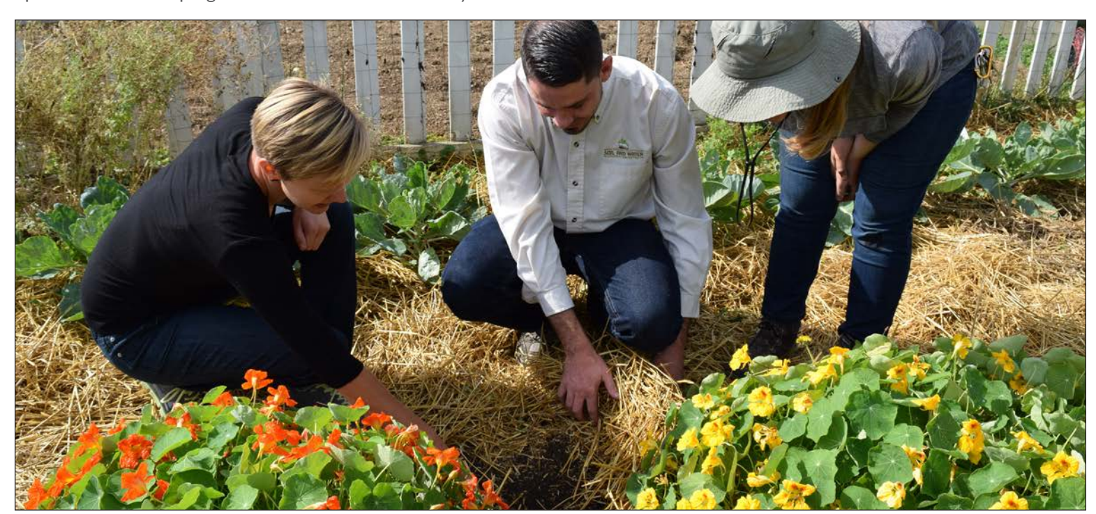
NRCS partner assisting small scale farmer with developing a customized conservation plan.

Visit the Natural Resources Conservation Service or visit farmers.gov/servicelocator to find your local NRCS office. You can also check with your local USDA Service Center, then make an appointment to determine next steps for your conservation goals.